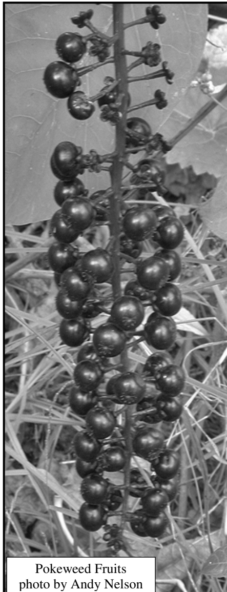
Pokeweed Fruits

We were also happy to learn that the birds love the berries; they are food for mourning doves, robins, jays, cardinals, rose breasted grosbeaks, yellow bellied