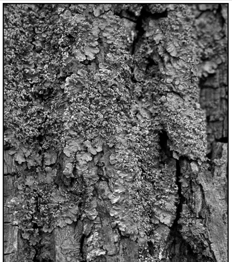
Powder-edged Speckled Greenshield ( Flavopunctelia soledica ) at McGowan’s Woods, Ithaca, Tompkins County, N.Y., March 2010. Massed on Basswood ( Tilia americana ) trunk.

Zoom ahead to 2003: While in Watkins Glen, Schuyler County, I noticed an unusual yellow-green lichen