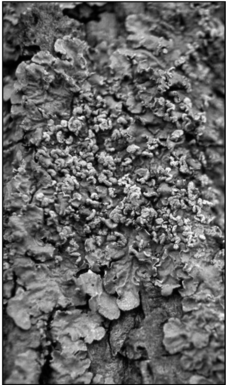
Powder-edged Speckled Greenshield ( Flavopunctelia soledica ) at McGowan's Woods, Ithaca, Tompkins County, N.Y., March 2010. Closeup of thallus showing white marginal soredia.

This species is similar to the closely related and more common Speckled Greenshield ( Flavopunctelia flaventior ), but is smaller, with few or no white pores ( pseudocyphellae ) on top; upward-arching, marginal, whitish powdery soredia (vegetative propagules that contain a few algal cells covered with fungal hyphae) that may extend beneath the lower surface in a labriform configuration; and a black, brown-edged lower cortex. Its main range is west of us. Jim & Pat Hinds (2007), in their Macrolichens of New England , reported it from one site each in Maine, New Hampshire, Vermont, and Connecticut. Brodo et al. (2001) also mapped a few eastern outliers in Pennsylvania and West Virginia. It is thus not unexpected in New York, but apparently quite sparse. It is probably more widely distributed, but still undiscovered, at other places in the State.