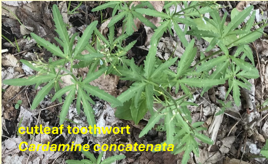
cutleaf toothwort Cardamine concatenata