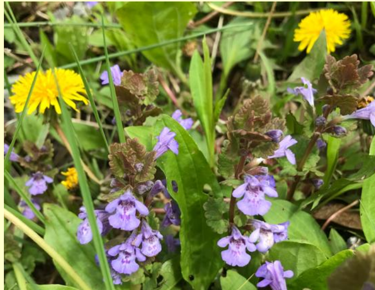
dandelion Taraxacum Officinale