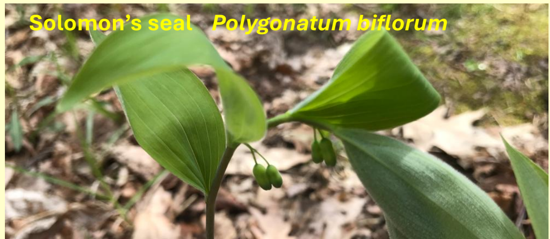
Solomon's seal Polygonatum biflorum