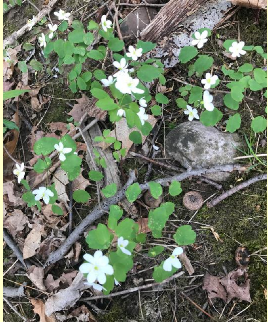
rue anemone Thalictrum thalictroides