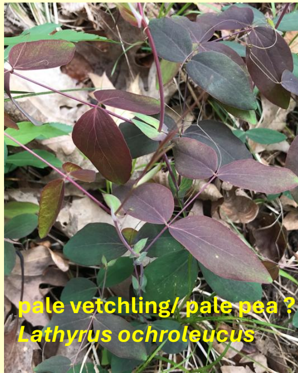
pale vetchling/ pale pea ? Lathyrus ochroleucus