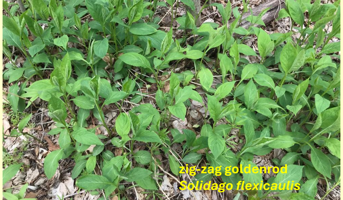
zig-zag goldenrod Solidago flexicaulis