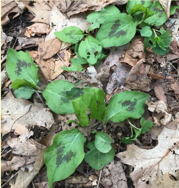
Virginia knotweed Persicaria virginiana