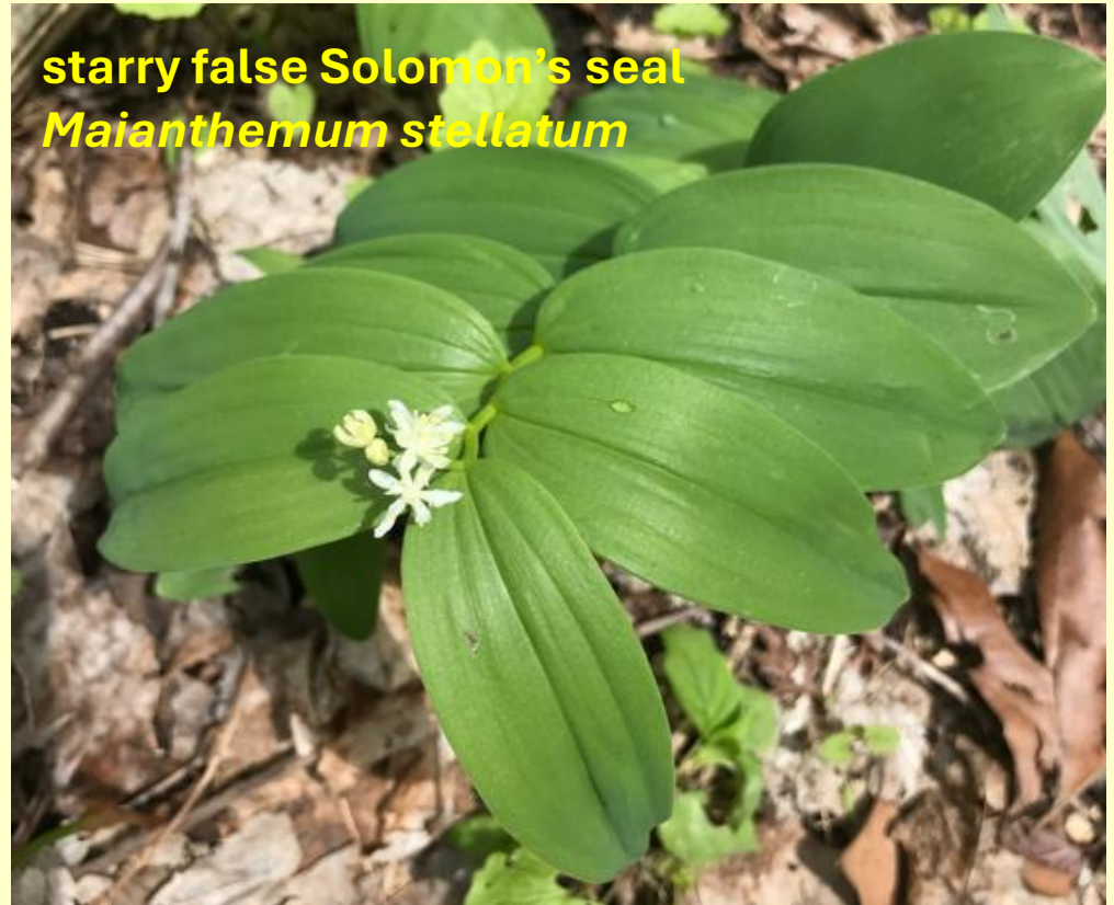
starry false Solomon's seal Maianthemum stellatum