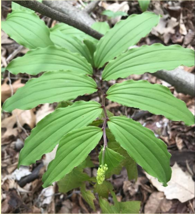
false Solomon's seal Maianthemum racemosum