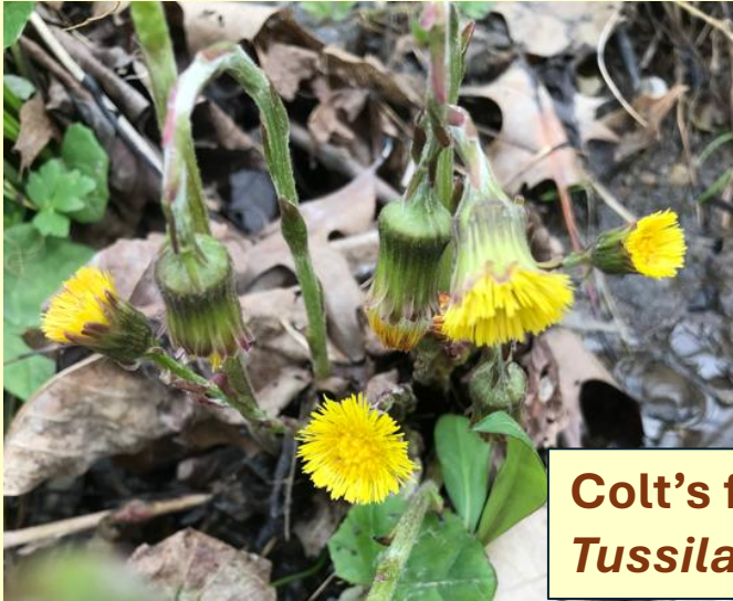
Colt's foot Tussilago farfara