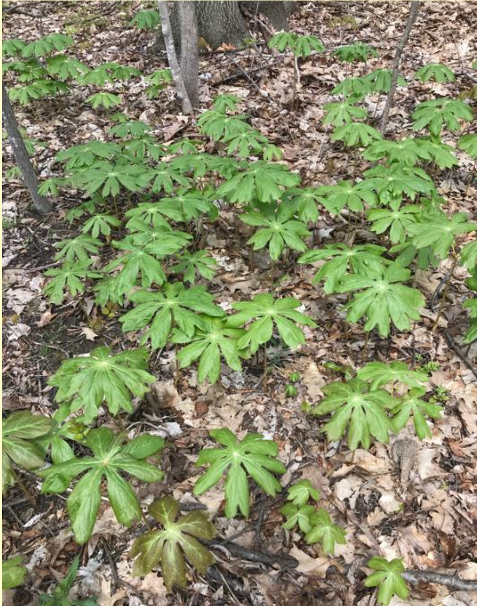
mayapple Podophyllum peltatum