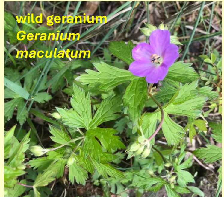
wild geranium Geranium maculatum