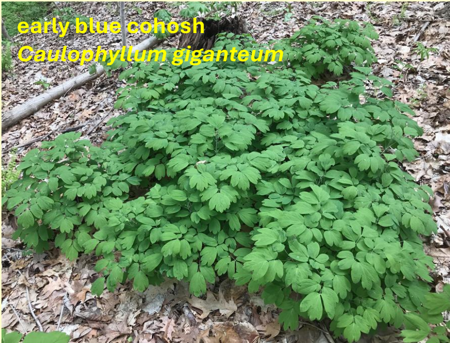
early blue cohosh Caulophyllum giganteum