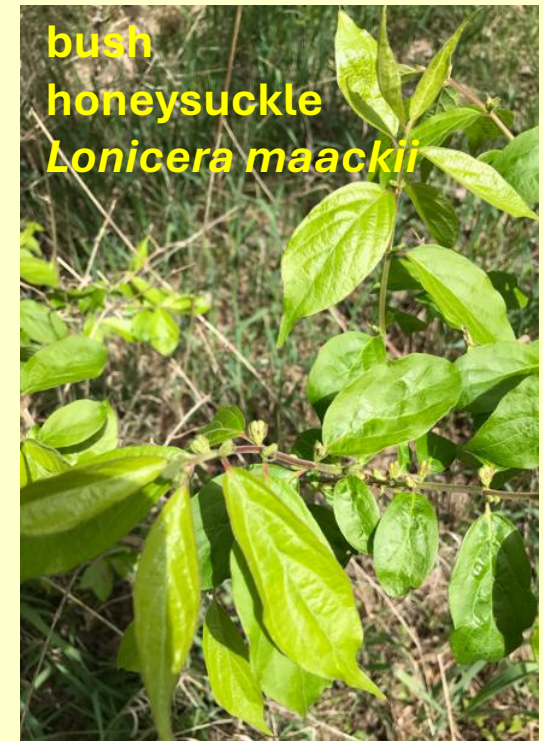
bush honeysuckle Lonicera maackii