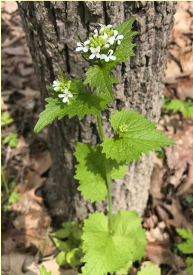
garlic mustard Alliaria petiolata Invasive, but pretty