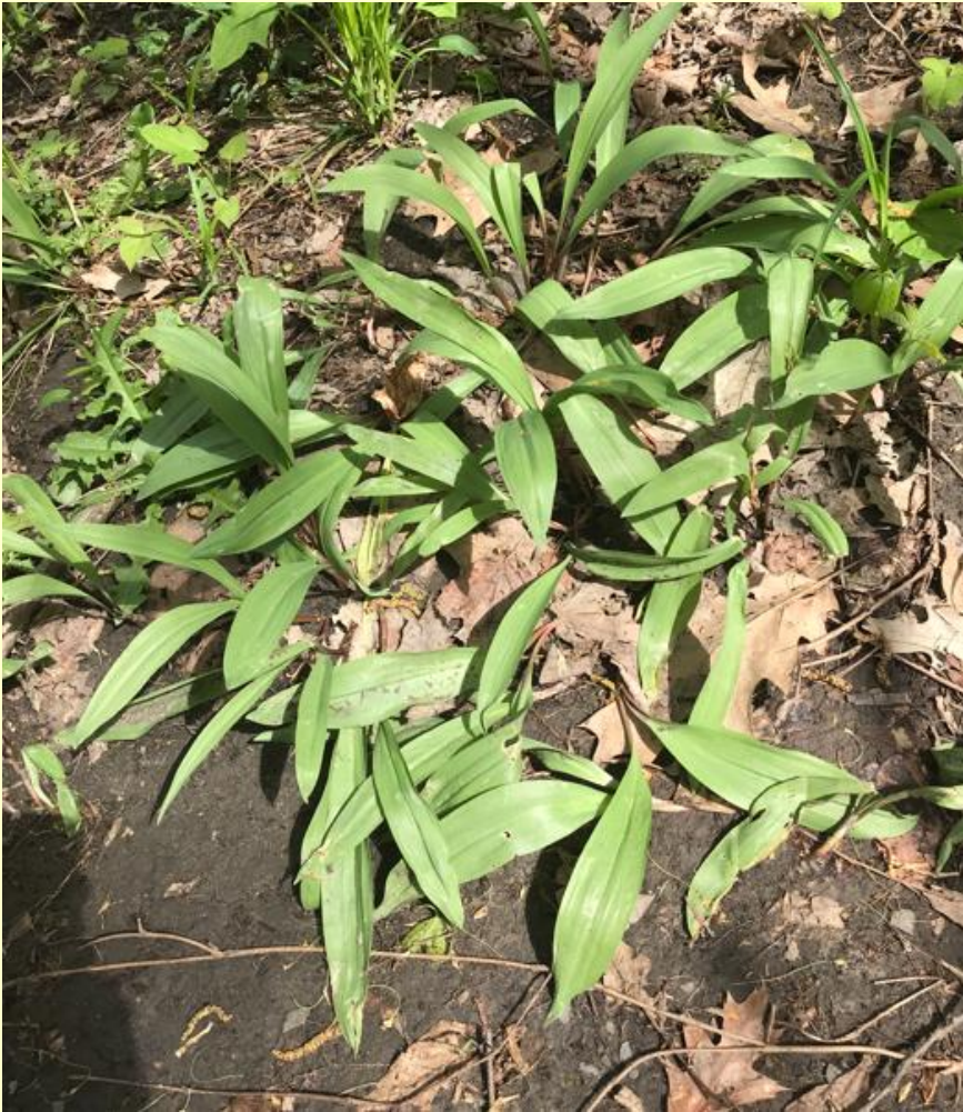
Wild leeks / ramps Allium tricoccum