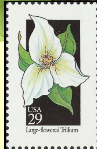
great white trillium Trillium grandiflorum