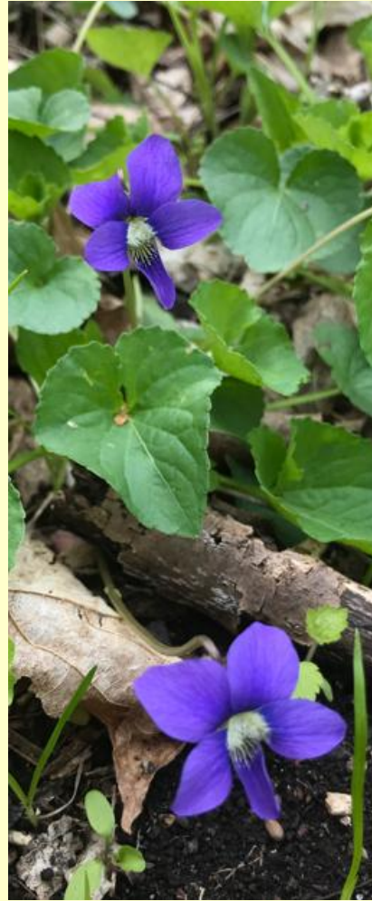
common blue violet Viola sororia