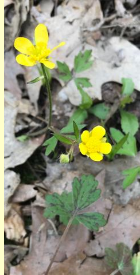
woodland buttercup Ranunculus hispidus