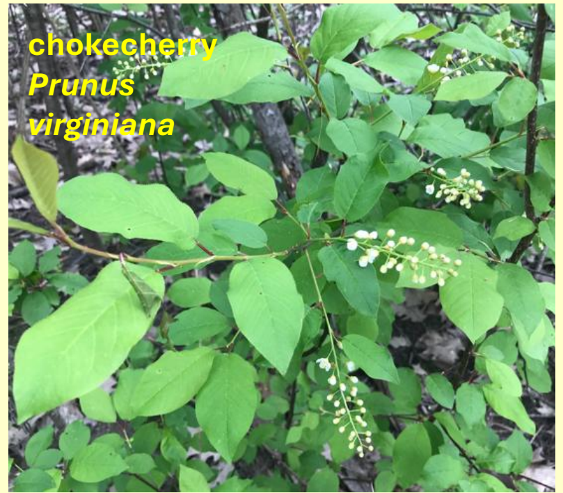
chokecherry Prunus virginiana