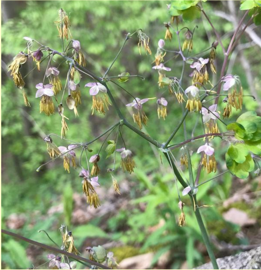
early meadow rue Thalictrum dioicum