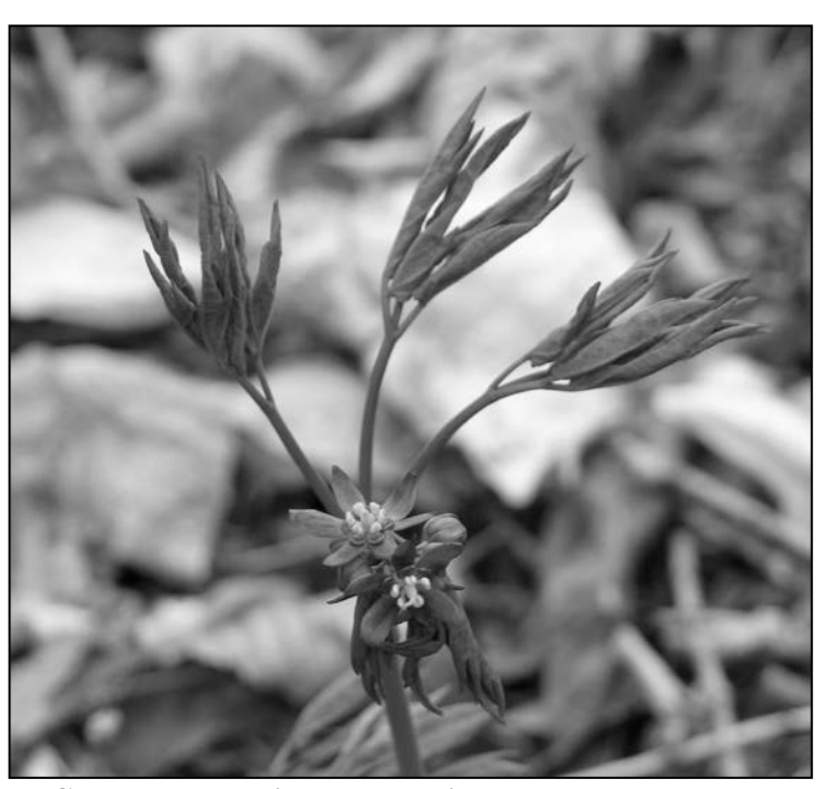
Caulophyllum giganteum - giant blue cohosh

Can not wait for spring! - Come to the FLNPS Winter Solstice Celebration (see next page for details)