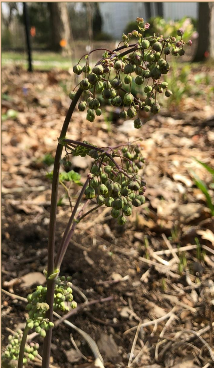
LEFT: And finally the shape and flower buds are identifiable. (Photo taken April 14, 2021.)

Illinois Wildflowers (nice photos): https://www.illinoiswildflowers.info/woodland/plants/early_mdrue.htm