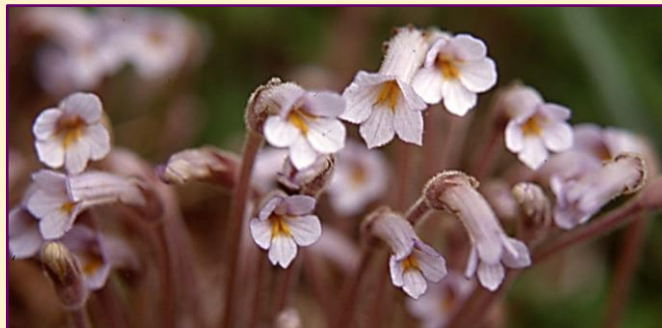
One-flowered Broomrape ( Aphyllon uniflorum ) blooms in late May and early June. It may be a parasite on goldenrods ( Solidago spp.). These were found in the ecotone between an old field and old-growth forest in Tompkins County, N.Y., on 31 May 1997.

We sponsor talks, walks, and other activities related to conservation of native plants and their habitats. Solidago is published as a colorful online version, and a B&W paper version that is mailed. The online format is posted 3 months after publication. Please see www.flnps.org for details of membership, past Solidago issues, and updates about our programs.